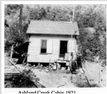
Ashland Creek Cabin 1971

OREGON SHAKESPEARE FESTIVAL IMAGES (in process) will include images of productions and theater buildings that document development of OSF from its origins in 1935, under the leadership of Angus Bowmer, to what is now one of the oldest and largest regional theaters in the country, with rotating repertory on three stages.